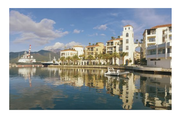
Montenegro Extension See Details