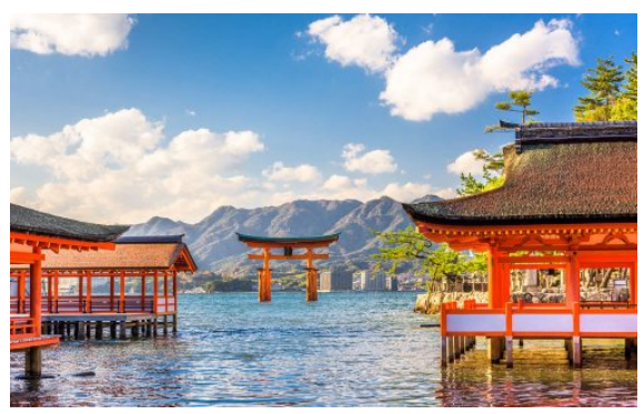
Hiroshima Post Tour Extension - A Luxury Small Group Journey (2024)