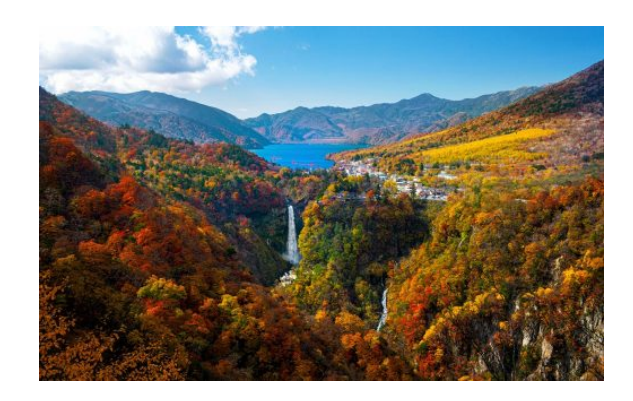
Nikko Pre Tour Extension -A Luxury Small Group Journey (2024)