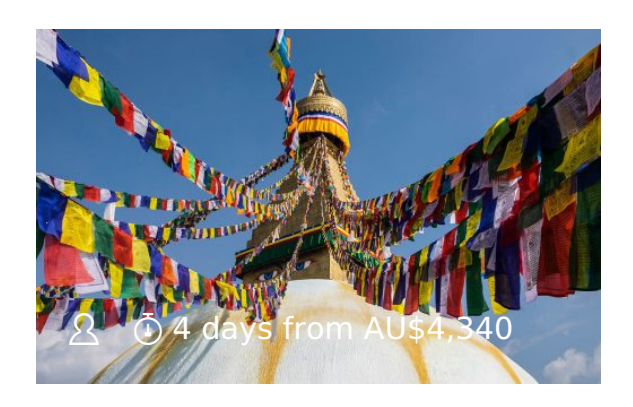
Nepal & Kathmandu Post-Tour Extension - A Luxury Small Group Journey (2024)