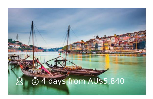
Porto Pre-Tour Extension -A Luxury Small Group Journey (2024)