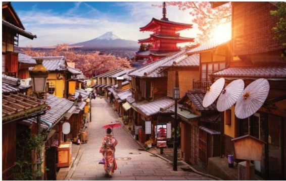
Kyoto Extension (2025) See Details