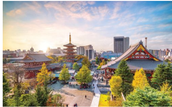
Tokyo Extension (2025) See Details