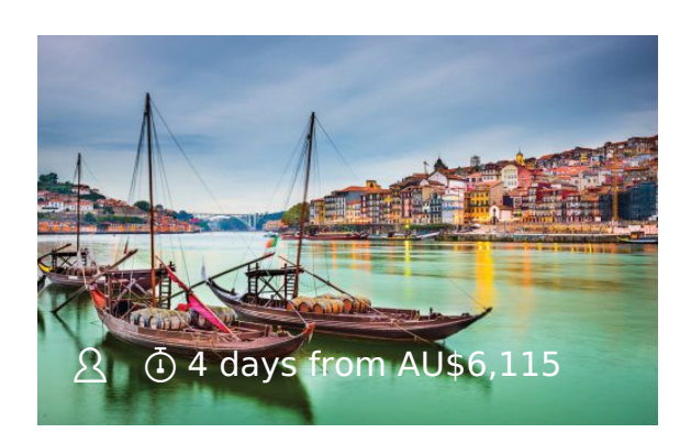
Porto Pre-Tour Extension -A Luxury Small Group Journey (2025)