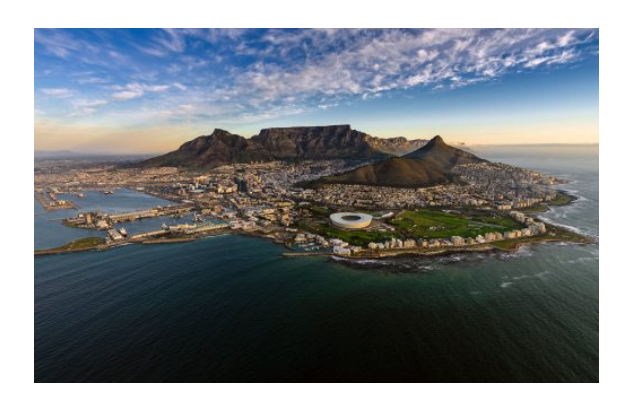
Cape Town Post-Tour Extension - A Luxury Small Group Journey (2025)